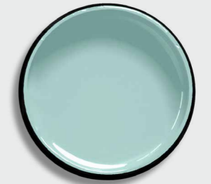
Resene Morning Haze