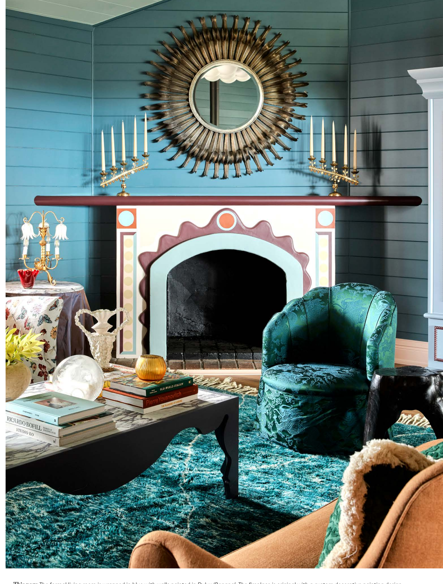
This page The formal living room is wrapped in blue with walls painted in Dulux 'Benang'. The fireplace is original with a custom decorative painting design by Duet. Above is a mirror and pair of candelabras, all vintage. A vintage light sits on a custom side table with silk skirt and Calacatta Viola top by Duet. Armchair re-upholstered in Schumacher 'Ruan Dragon' damask in Emerald. Nord Modern sofa covered in 'Lexus Gingerbread' fabric from Warwick with custom cushions in Schumacher 'Vermicelli Velvet' in Emerald with Inge Holst brush trim in Natural. Calacatta Viola-topped coffee table by Duet. The glass sphere is vintage and the vessel is by Hilary Green. Berber rug from Kulchi.

A wide hallway runs uninterrupted from the entry to the rear garden, decorated with plants on shelves, inspired by an indoor conservatory. A large bedroom sitting to the left is followed by a pitched-roof breakfast room and French doors that lead to the kitchen, a pretty and punchy space with new servery windows »